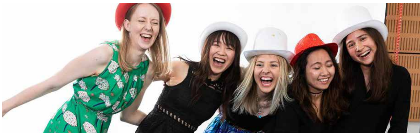
RMIT Christian Club

RMIT Supply Chain Student Association (SCSA), Pizza Night and AGM @ RMIT Garden Terrace Building 10