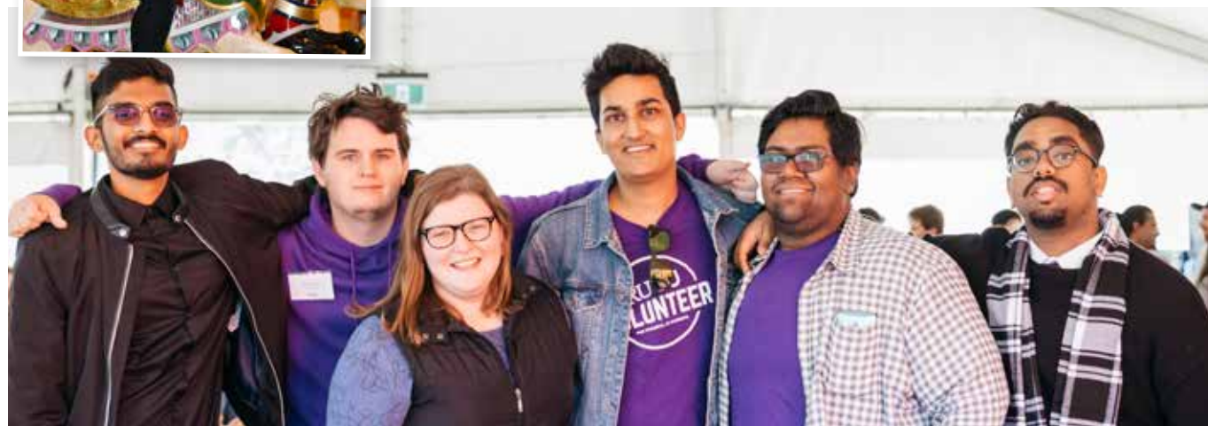
End of Year Volunteer Appreciation Party