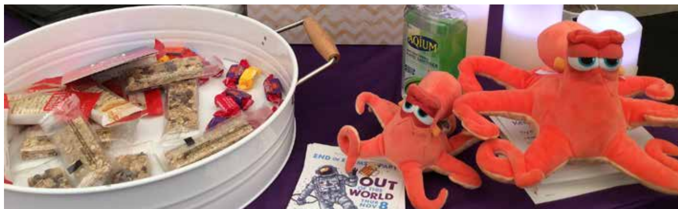
Compass & RMIT Wellbeing Exam Calm Zone