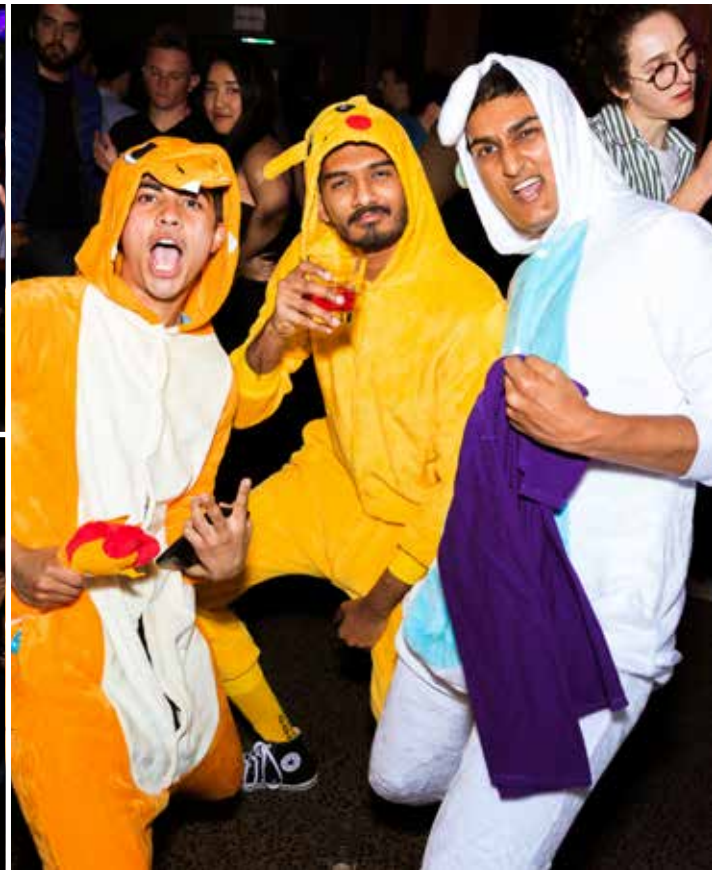
End Of Exams Party: Out Of This World