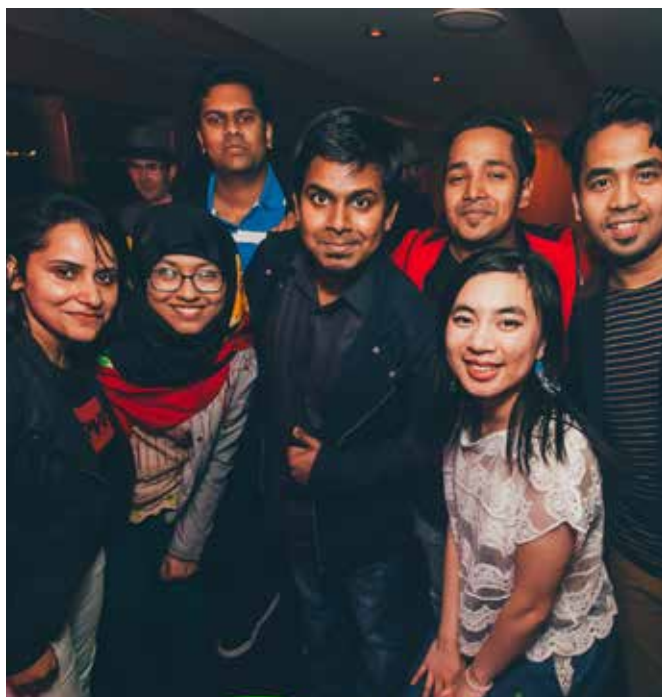
Tech Clubs Boat Party

RMIT Science Fiction & Gaming Association (SFGA), AGM & Lasertag @ AGM at RUSU Multipurpose Room Building 57 & Lasertag at QV