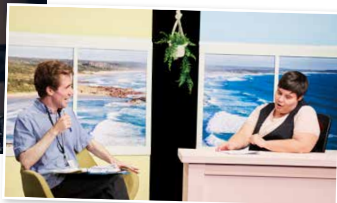
RMITV in action

RMITV currently has 501 members . This is approximately 80 more than our average.