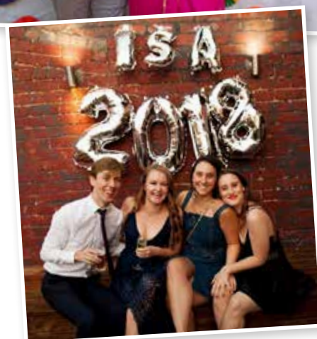
Diwali and ISA Graduation