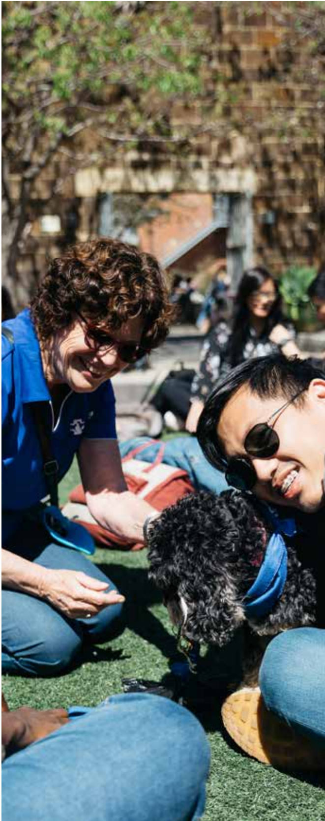
Stress Less Week with the therapy dogs

Table 2 reports on the specific grants approved by the SSAF Committee.