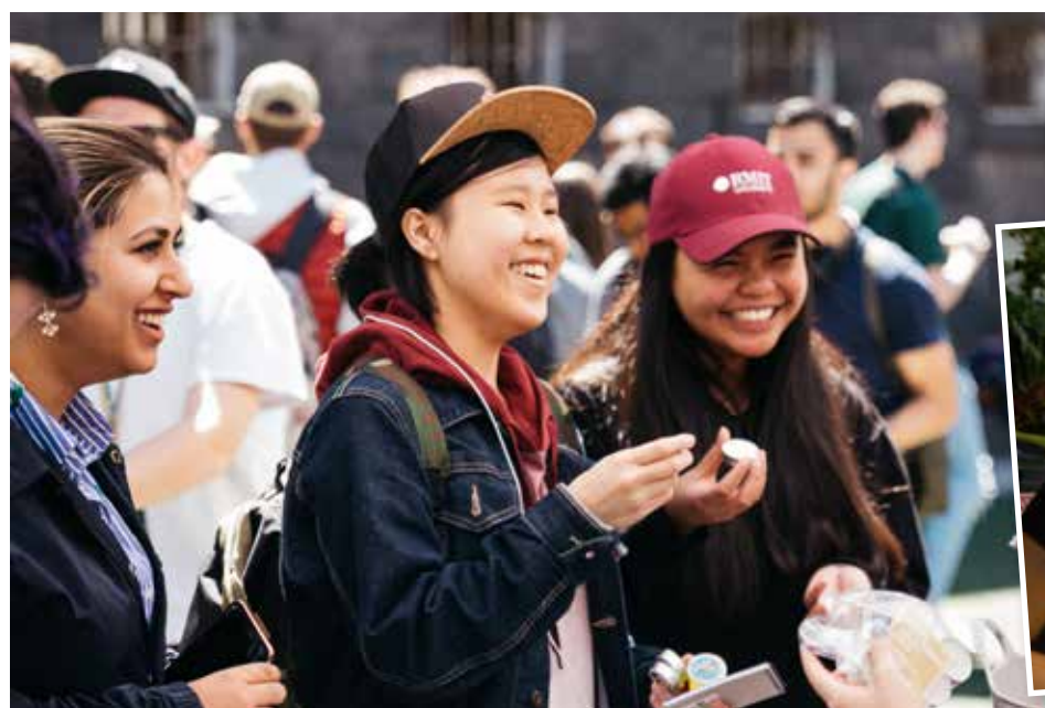
RUSU Departments in action

Realfoods has continued its success in maintaining volunteer numbers for the period, particularly at Bundoora where volunteer retention is at an all time high since opening in March, 2016. A waiting list for the City program continued right up until the end of the semester. The City store has continued to increase its catering aspect of the business, involved in more events than in any other semester.