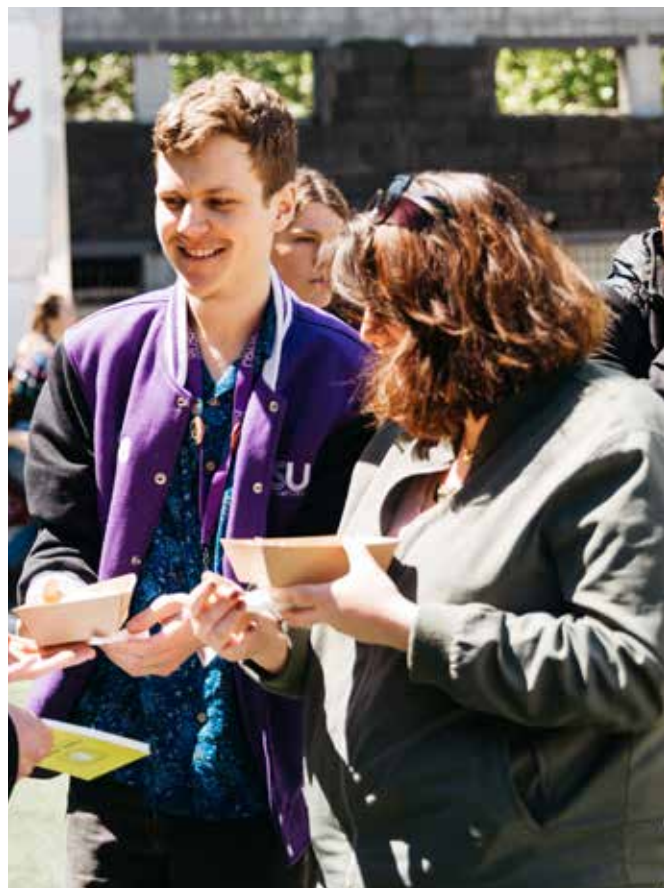
Chill N Grill is a favourite across all campuses

RUSU free lunches cater to our diverse student population, including halal and vegan options.