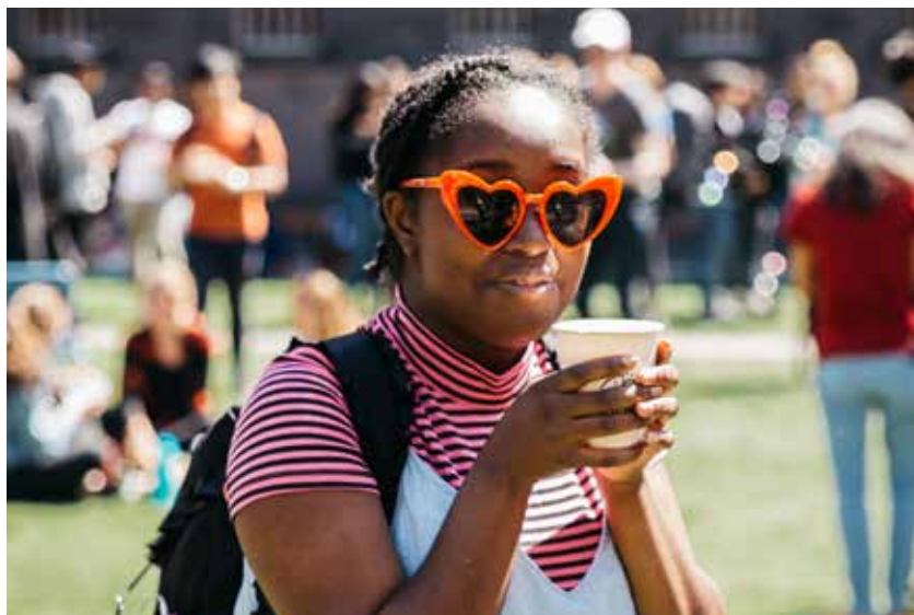
Chill N Grill in Alumni Courtyard

Each week, around 250 students have free drinks (soft-drinks, beer or cider) and entertainment inside the RUSU member's tent. In 2018, 5250 students have participated in the member's tent events.