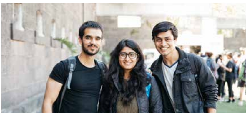
Volunteer Appreciation Day in the City